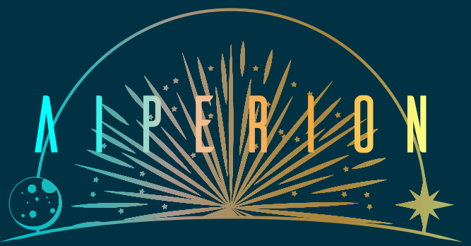
Full logo - overlaid