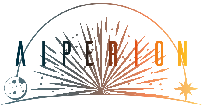
Full logo - overlaid

For dark backgrounds please use logos with this gradient